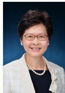
Carrie Lam Cheng