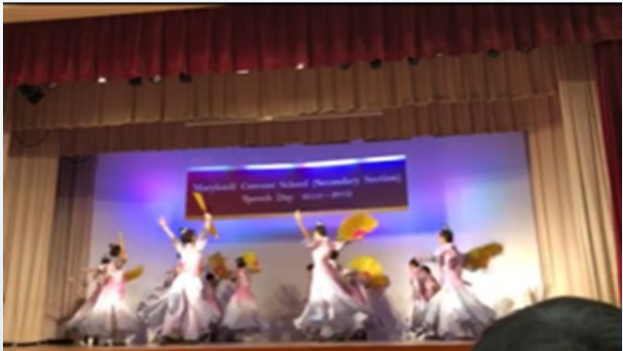
Chinese dance performance.