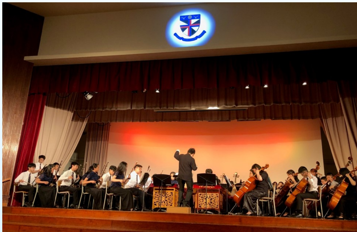
MCS Chinese Orchestra performs with La Salle College students.

The Music Association presented “Symphonie d’Ete” on Saturday July 6, 2019 in the school hall. The program consisted of music performed by the school orchestra, the Chinese orchestra and the school choir. La Salle College and Wah Yan Kowloon students joined the MCS musicians and supported the event by performing with the Maryknoll orchestra.