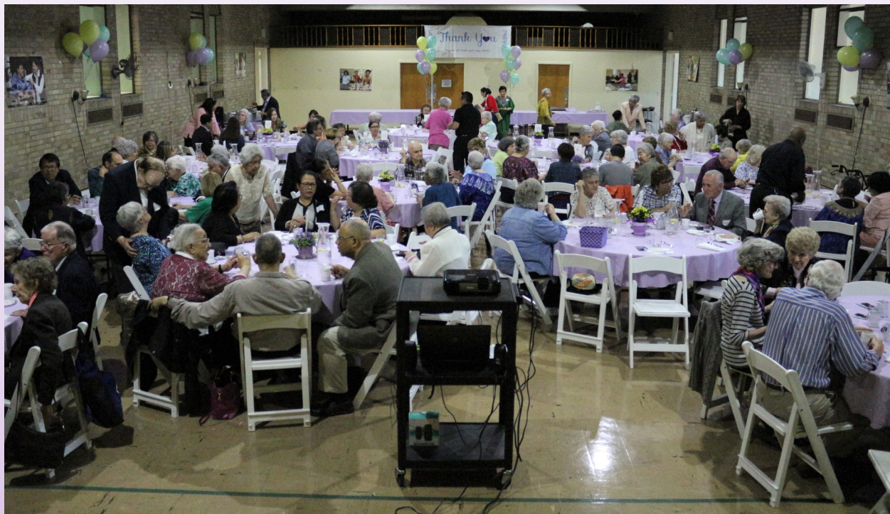
Maryknoll Sisters hosting luncheon for benefactors.

Maryknoll Sisters Center held its annual Benefactor's Day on Sunday, May 19. A Mass was held in the morning followed by a luncheon. Maryknoll Sisters are very grateful for the donors whose generosity supports and makes the Sisters' global mission work possible. At the luncheon Sisters updated benefactors on the latest news and the work of Maryknoll Sisters worldwide.