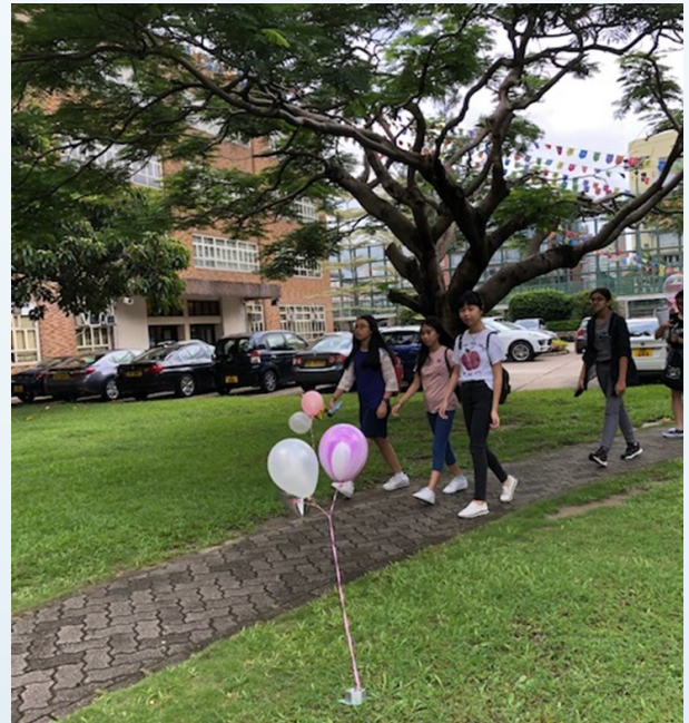
Scenes from the MCS Fun Fair.