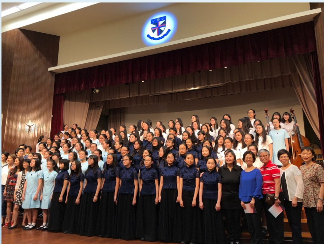
Group photo after concert.