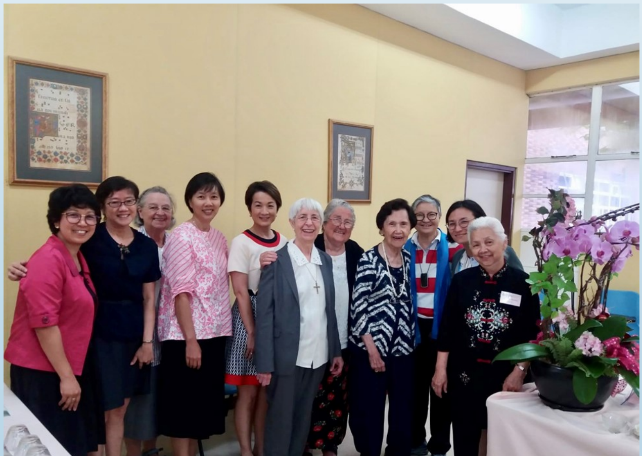
Tea reception at speech day.