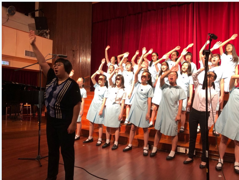
MCS Choir pays tribute to Queens.