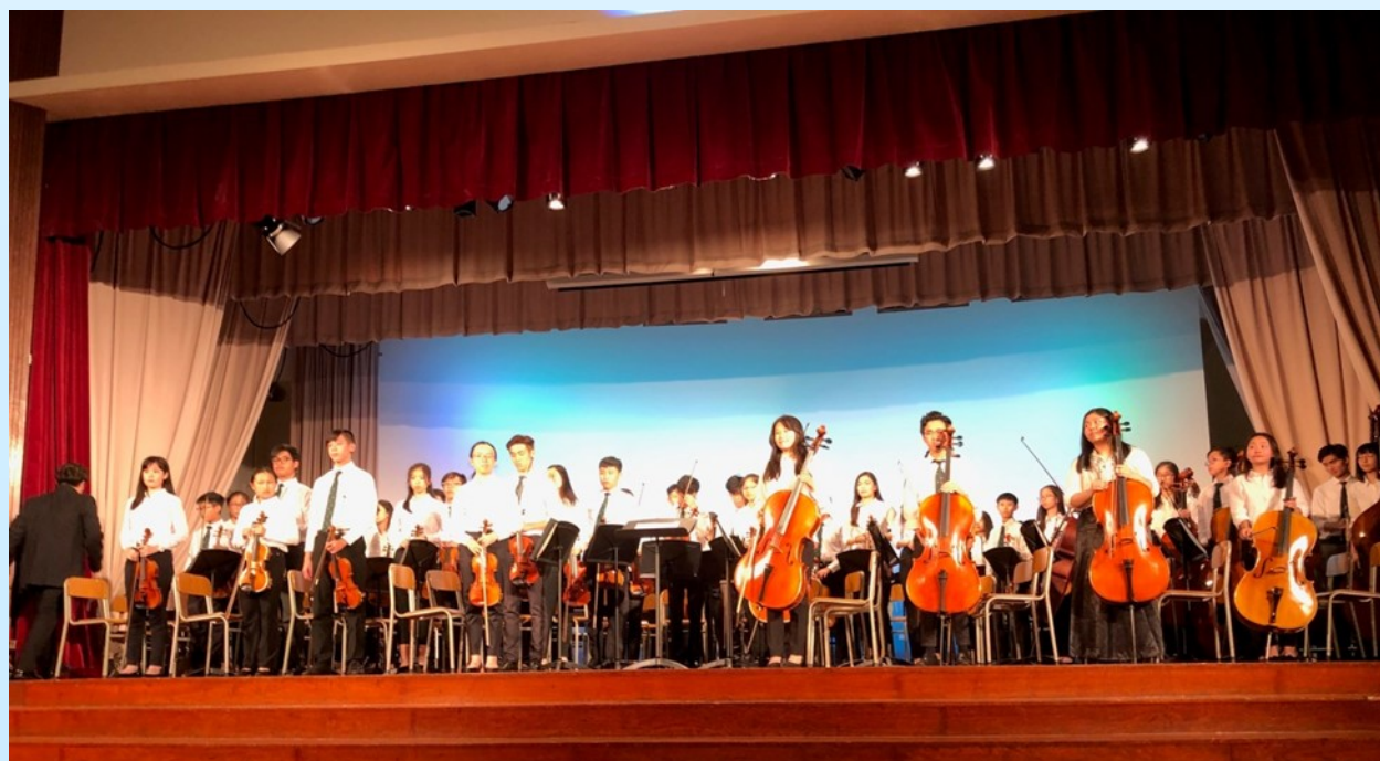
MCS Orchestra performs with Wah Yan Orchestra.