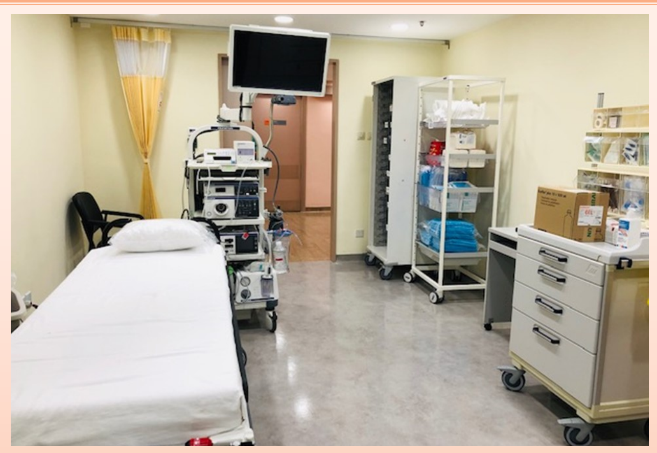
Endoscopy procedure Room Two