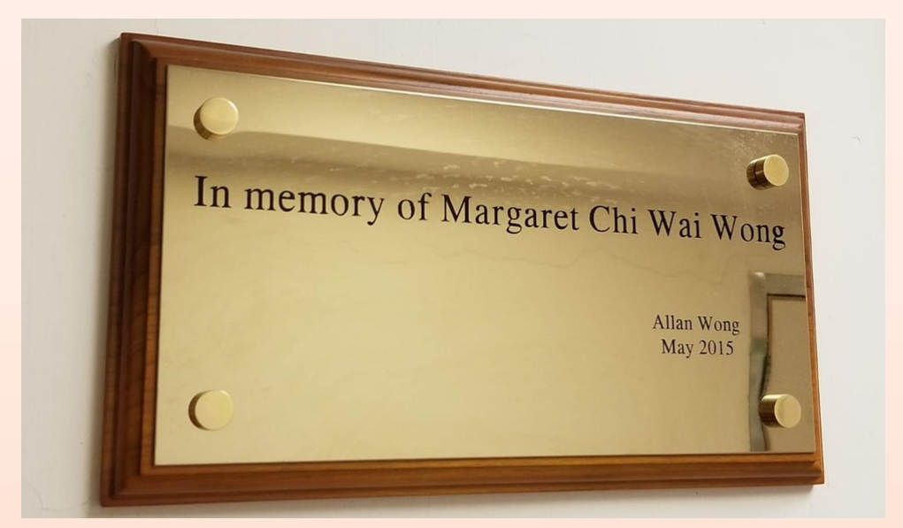
Densitometry machine ( DEXA) Entrance at OLMH- HA