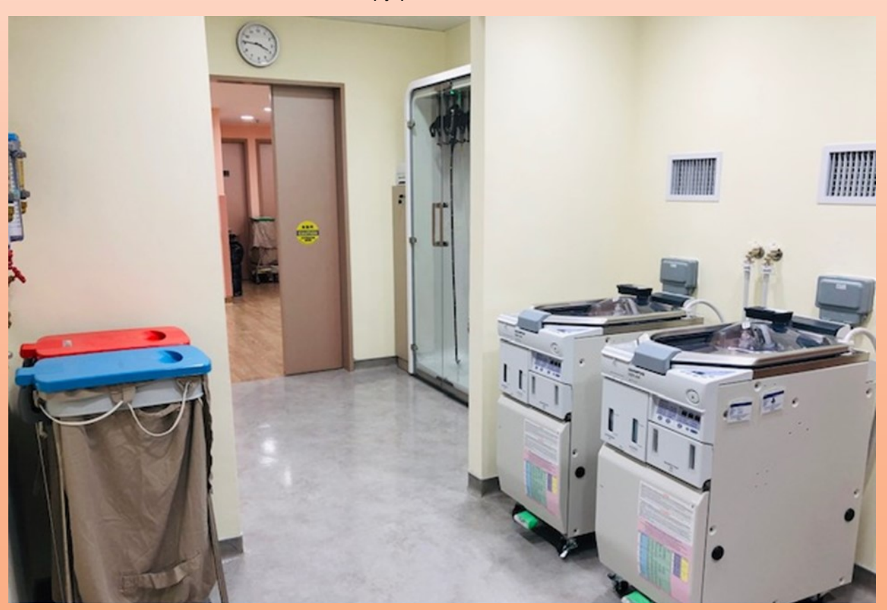
Equipment and Tools Preparation and Sanitization Room