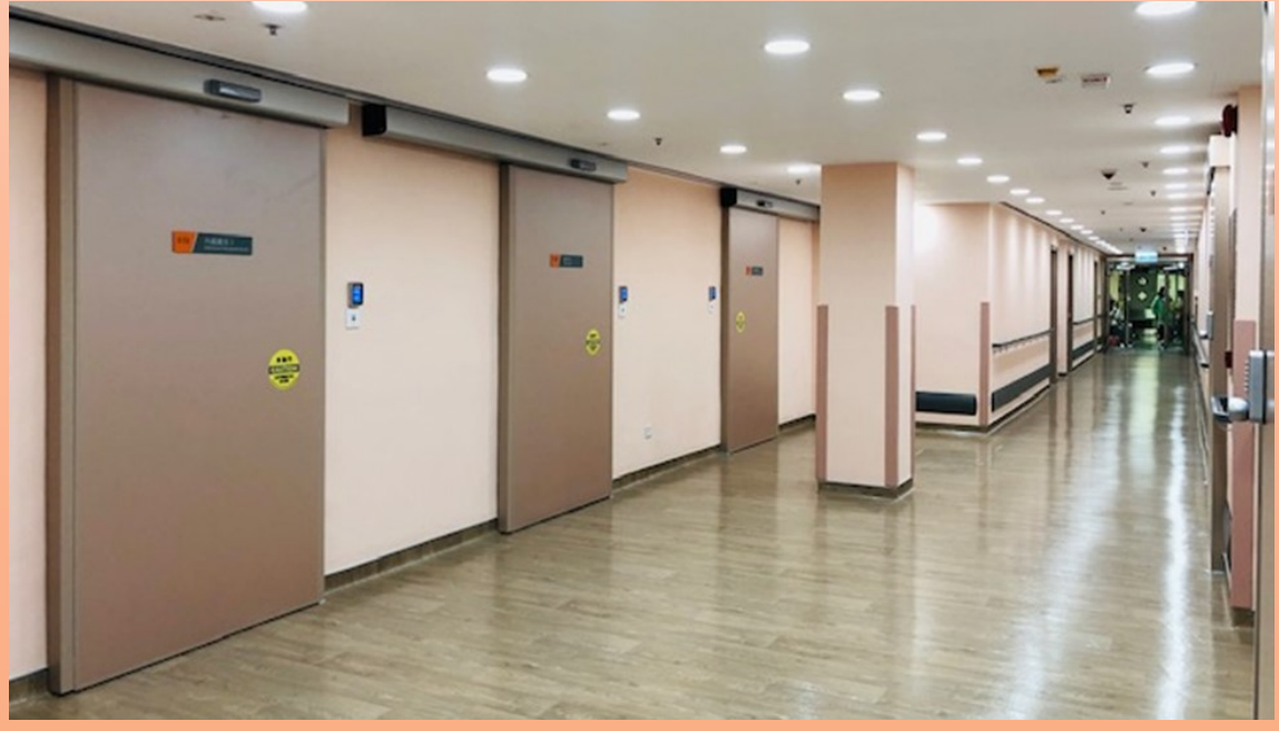
New Endoscopy Center at CSC (primarily funded by private donations)