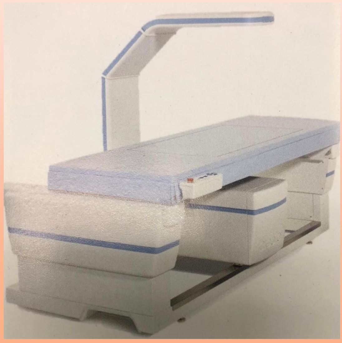
Densitometry machine (DEXA) – a private donation