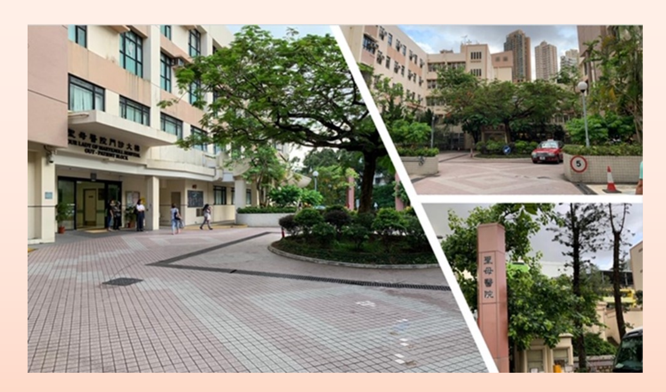
Outpatient Block OLMH