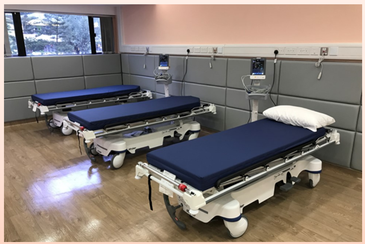
Endoscopy Recovery Room