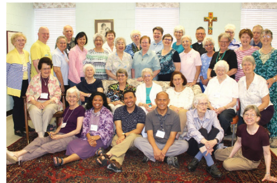
Participants from all walks of life show their joy at participating in their Mission Institute Program