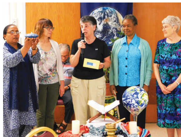
Small group discussion on Multicultural sharing toward One earth Community