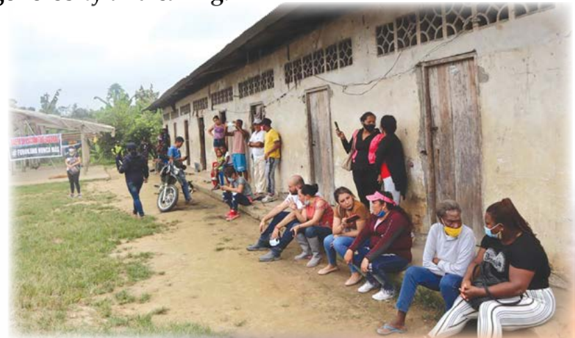
Barracks for Furukawa Plantations Company workers in Ecuador